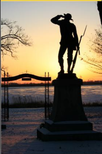
Dawn at JI January 25, 2008

Non-Profit Organization U.S. Postage PAID Permit No. 57 Tiffin, OH 44883