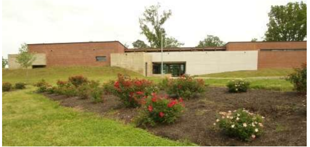
Corinth Civil War Interpretive Center

coming. At 7 a.m., Van Dorn's Division commander Lois Hébert sent word to Van Dorn that he was too ill to lead his division, and Brig. Gen. Martin E. Green was ordered to assume command and advance at once. Nearly two hours more elapsed before Green moved to attack with four brigades in echelon on Battery Powell on the Union right.